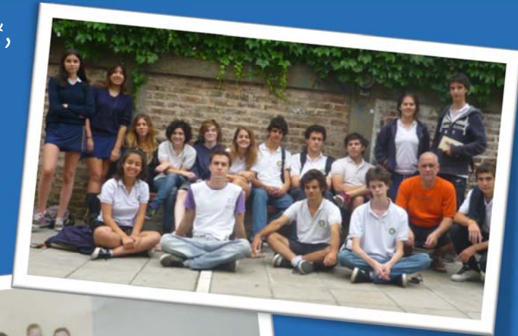
Colegio Piaget, San Isidro, Argentina