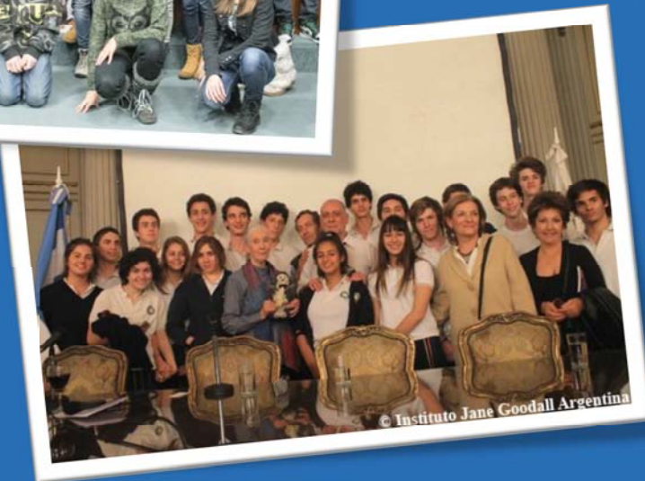
Buenos Aires, Sept. 2013