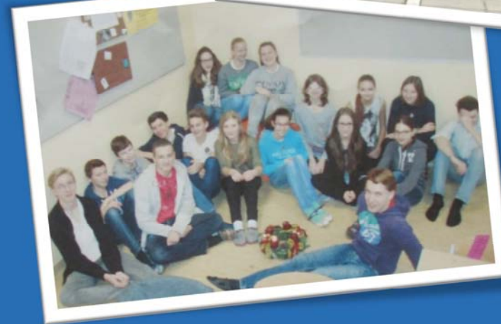
R&S group Dominikanerinnen, Vienna, Austria